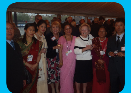
Some of those attending