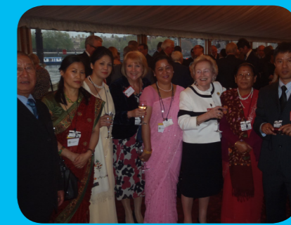
Some of those attending